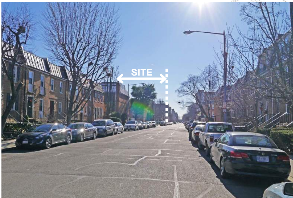
4 6TH AND G STREET LOOKING SOUTH