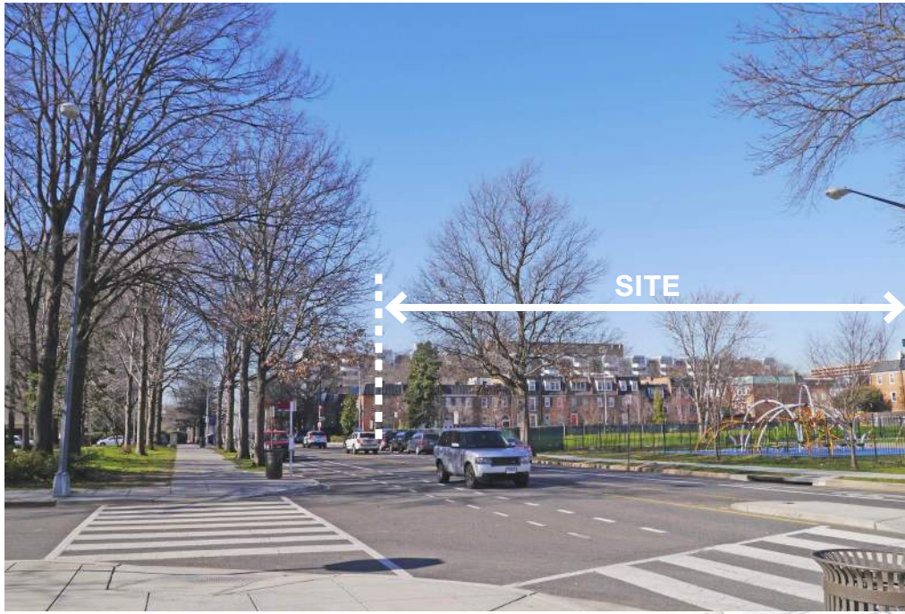
1 EYE AND MAKEMIE LOOKING NW