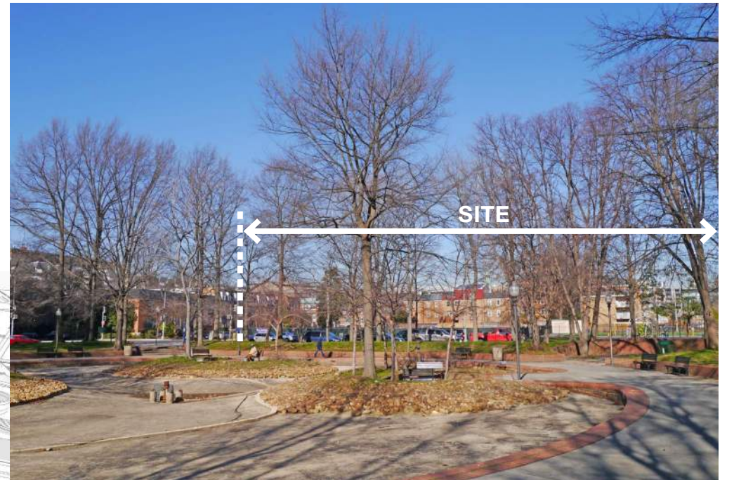
2 DUCK POND LOOKING NW