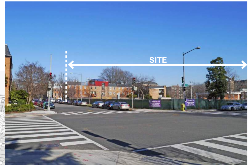
2 EYE AND 6TH LOOKING NE