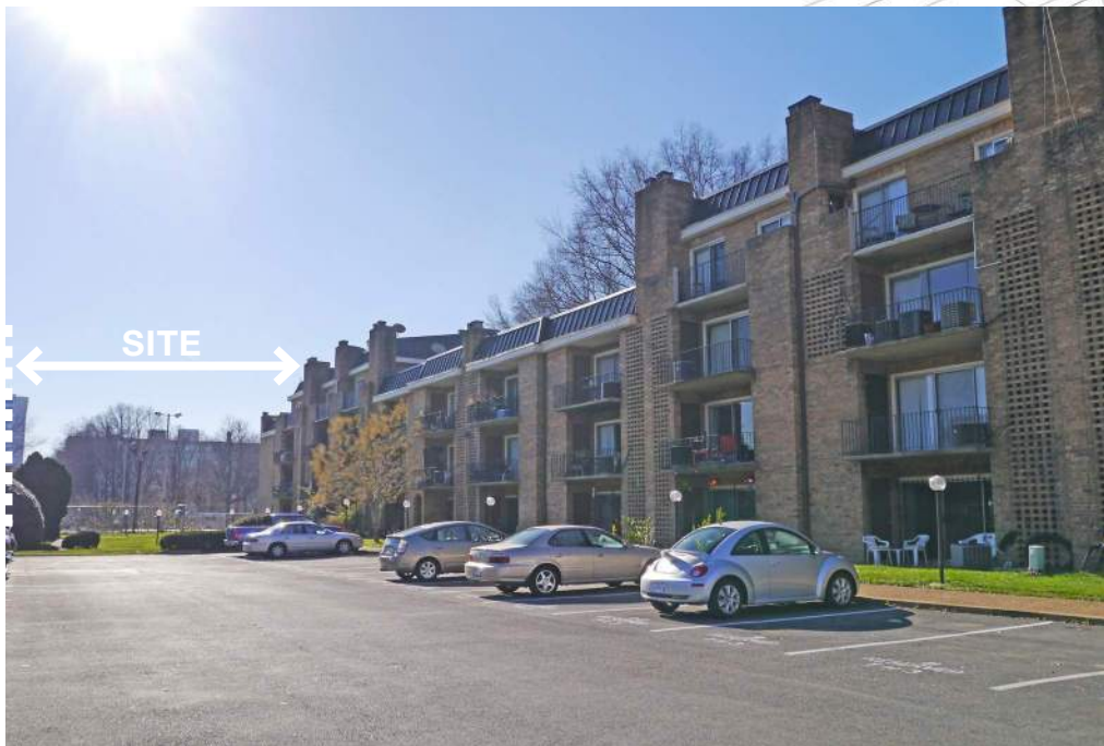
4 NORTH TOWNHOUSES LOOKING SOUTH