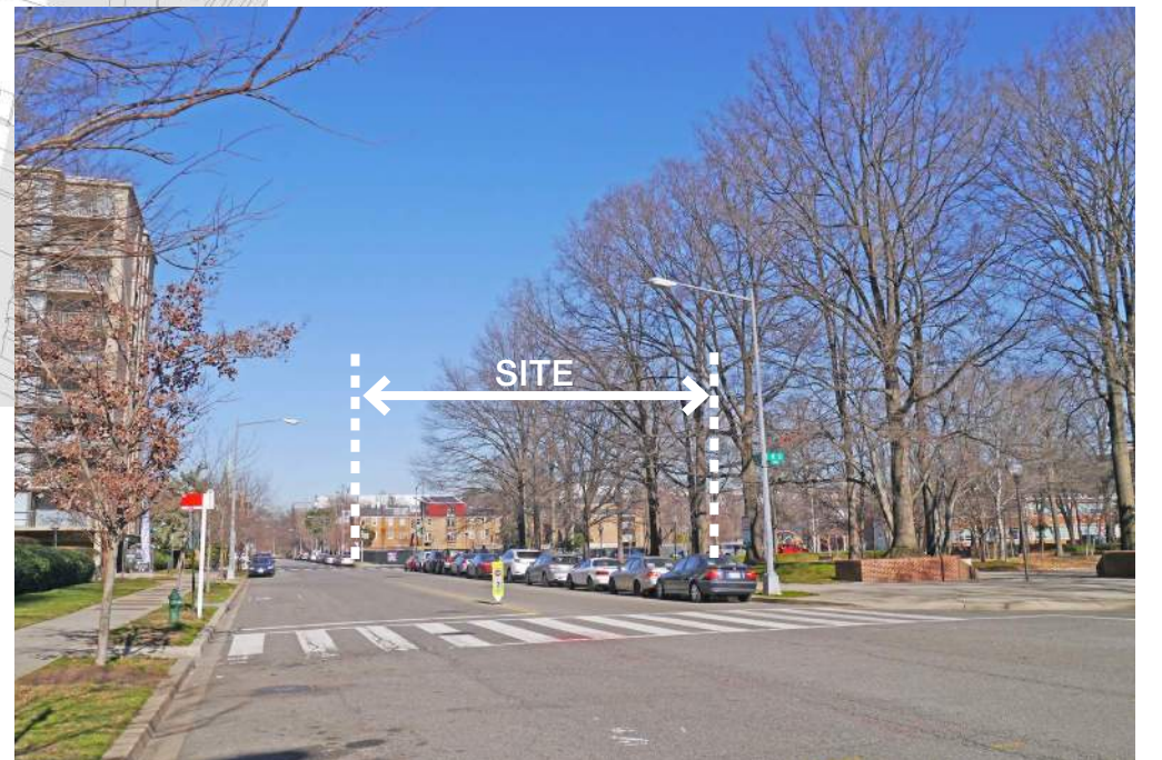
3 K AND 6TH LOOKING NORTH