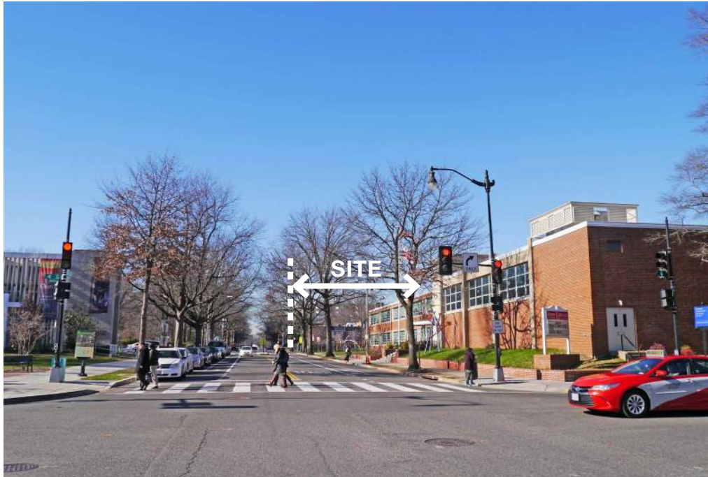
1 4TH AND EYE STREET LOOKING WEST