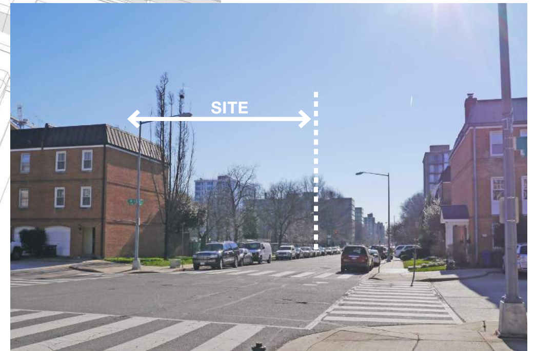
3 H AND 6TH STREET LOOKING SOUTH